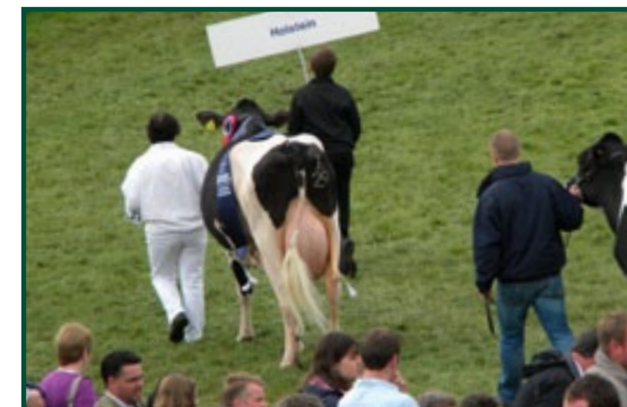
The Royal Highland Show is an annual celebration of Scottish agriculture. The show attracts up to 5,000 head of livestock annually and draws more than 180,000 visitors each year.

In addition to the winning Michigan team, the teams who finished in second and third place overall at the national contest also received an invitation to take part in the International Livestock Judging Tour. It was the sixth time in nine years that the Michigan youth dairy judging team earned an invitation to travel to Europe – it placed second or third five times in the last eight years – but 2012 marked the first time it finished No. 1.