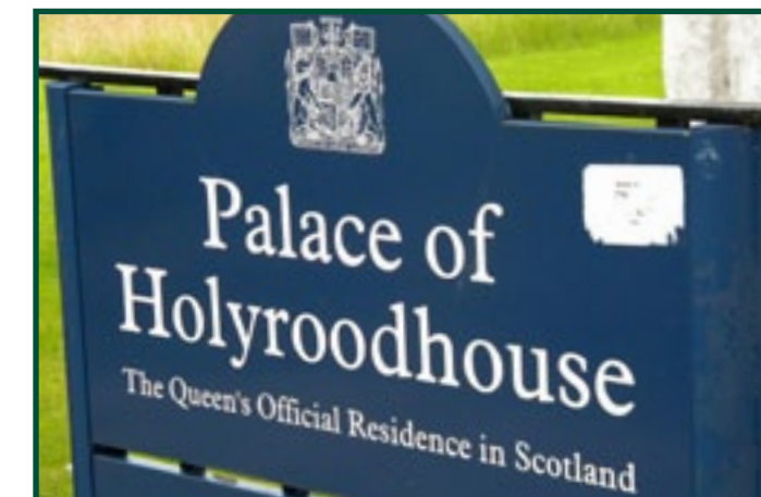
Seeing the sites is one of the highlights of the International Livestock Judging Tour. Many times this may be the only opportunity someone may have to visit Europe.